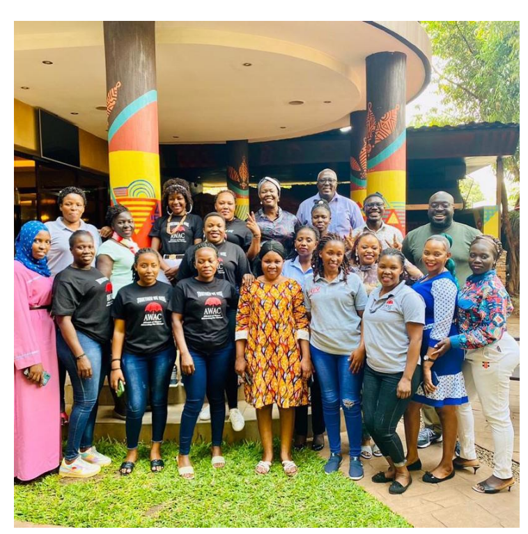
UHRN Participated in policy &advocacy training for Key Population CSOs conducted by @IAVI